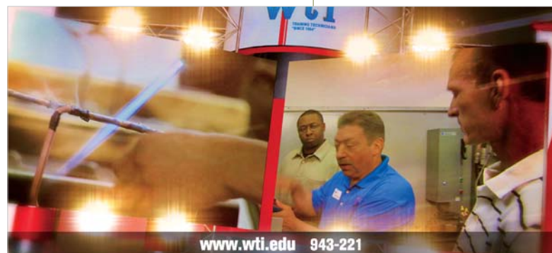
Wichita Technical Institute Forward Motion Television Campaign