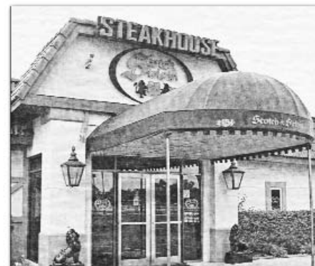
Feeling special at the Scotch