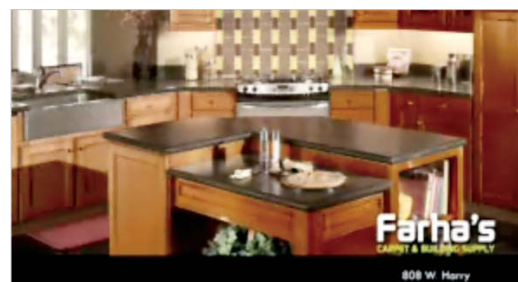
Farha's Carpet & Building Supply Television Billboard