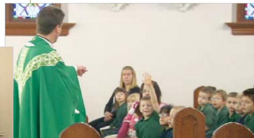
Catholic Diocese of Wichita TOGETHER Video Appeal