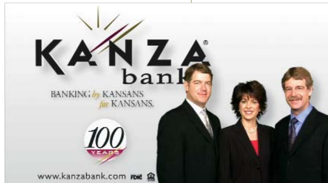
KANZA Bank Television Commercial