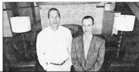
Benchmark Financial moving to new office at the Waterfront

Wichita Business Journal • September 11, 2009